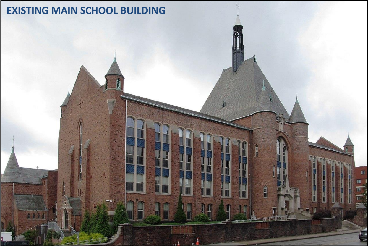
EXISTING MAIN SCHOOL BUILDING